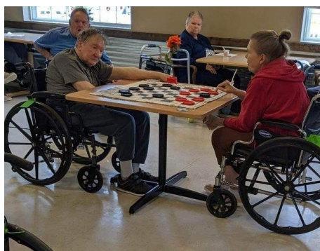
It's a serious game of checkers at the afternoon Ice Cream Social