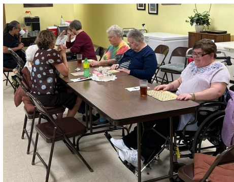
Another afternoon of bingo at the Senior Center! Always an enjoyable time!