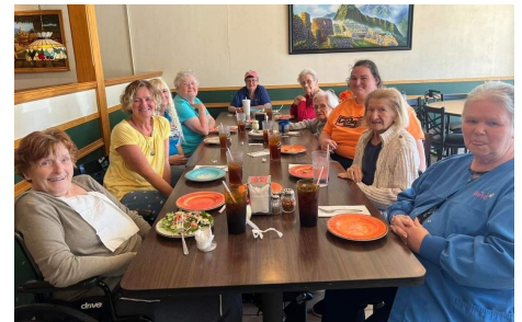
The group enjoying good food and friendship!

Spring has delivered some beautiful days of sunshine! What a great idea to take a ferry ride across the Illinois River and enjoy some fantastic pizza at Alfonso's!